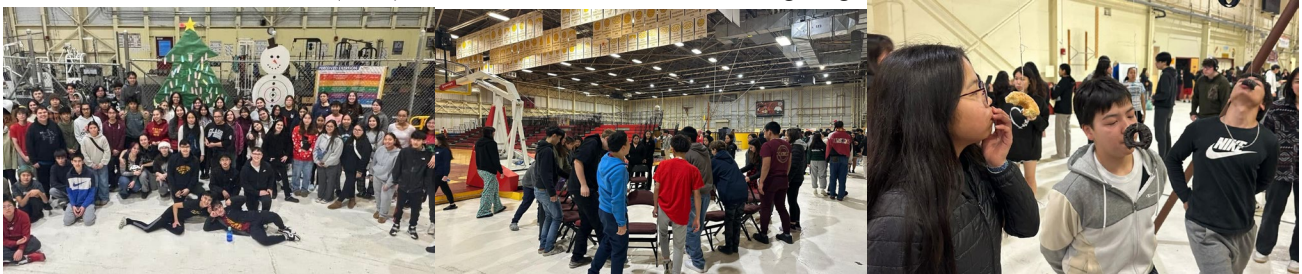
Holiday winter games and Thanksgiving carnival provide fun and excitement near and during the holidays.