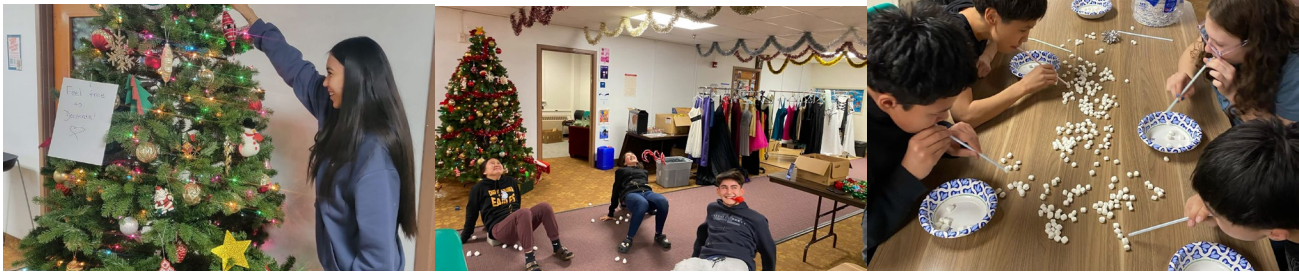
Holiday activities help to get students through the last few weeks, to relieve the intensity of the last few weeks and finals.