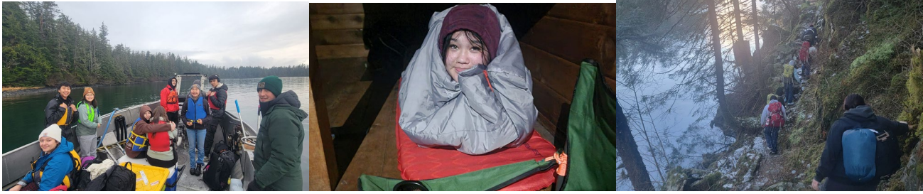
Recreation activities include some camping trips to Samsing Cabin - boating, hiking, cabins, sleeping bags, fun times!