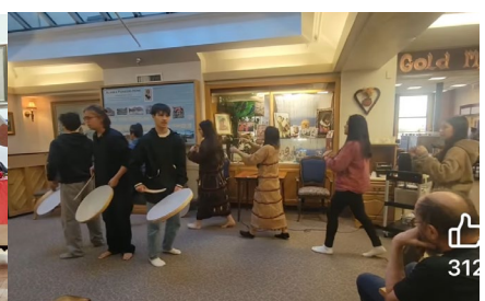
Unangax and Yup'ik dance groups helped with St. Michael's Day at the ANB Hall. Performances for elders in November.