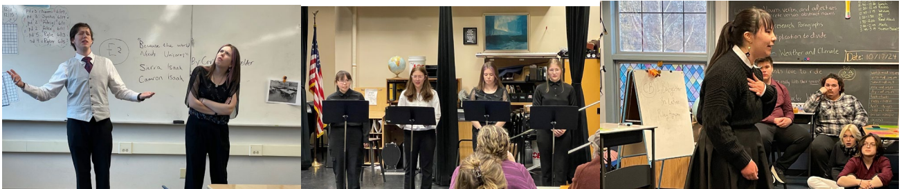
Drama, Debate, and Forensics (DDF) demonstrated their skills at Thanksgiving dinner.