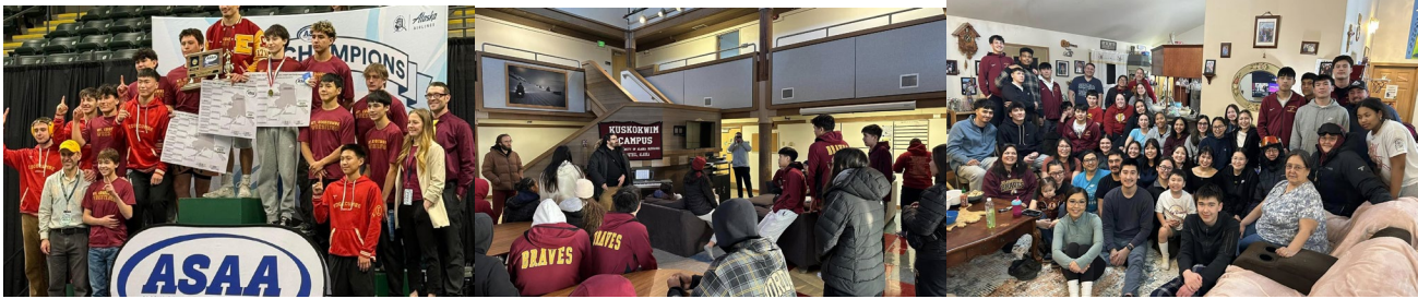
State Wrestling Champions!