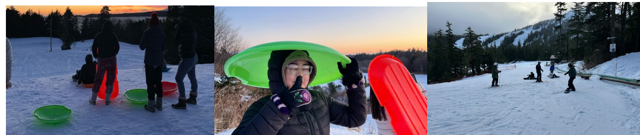
Late January, early February brought snow to Sitka. Recreation activities include getting students out while it lasts.