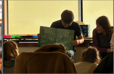
Educators Rising students were featured in the Sitka Daily Sentinel for their volunteer work with Babies for Books