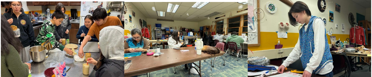
Cultural activities also include a variety of sewing, beading, cooking, baking, eating together. Open every day.