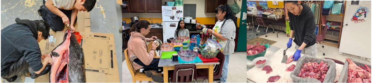
Cultural activities include butchering, cooking, and eating various subsistence foods as well as fish skin tanning.